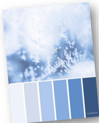
White and blue