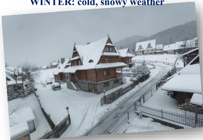
WINTER: cold, snowy weather