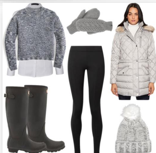
A sweater, a hat, a winter jacket, leggings and boots