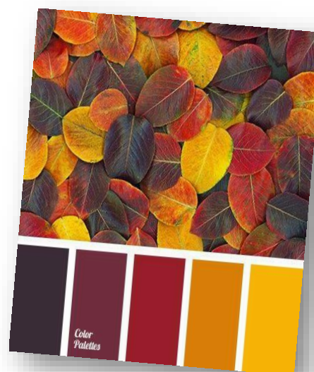
Dark green, yellow, brown, red and orange