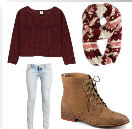
Leather shoes, a scarf, jeans and a sweater